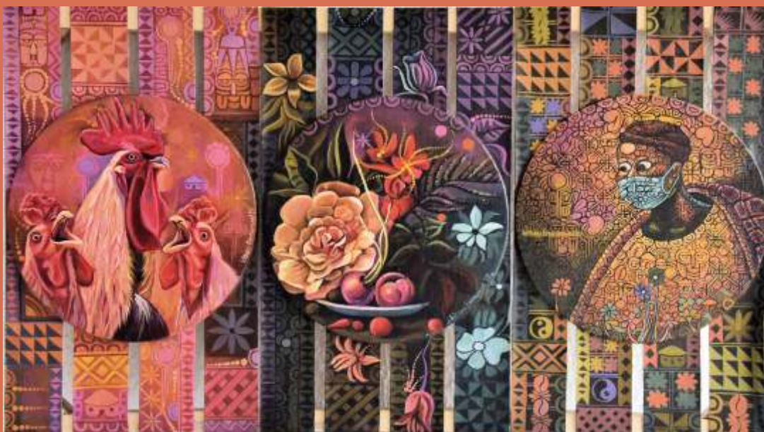
3pm Rose , Medium: Acrylic on Window Blinds, Canvas on Circular Board Dimension: 34.6x19.6 inches.