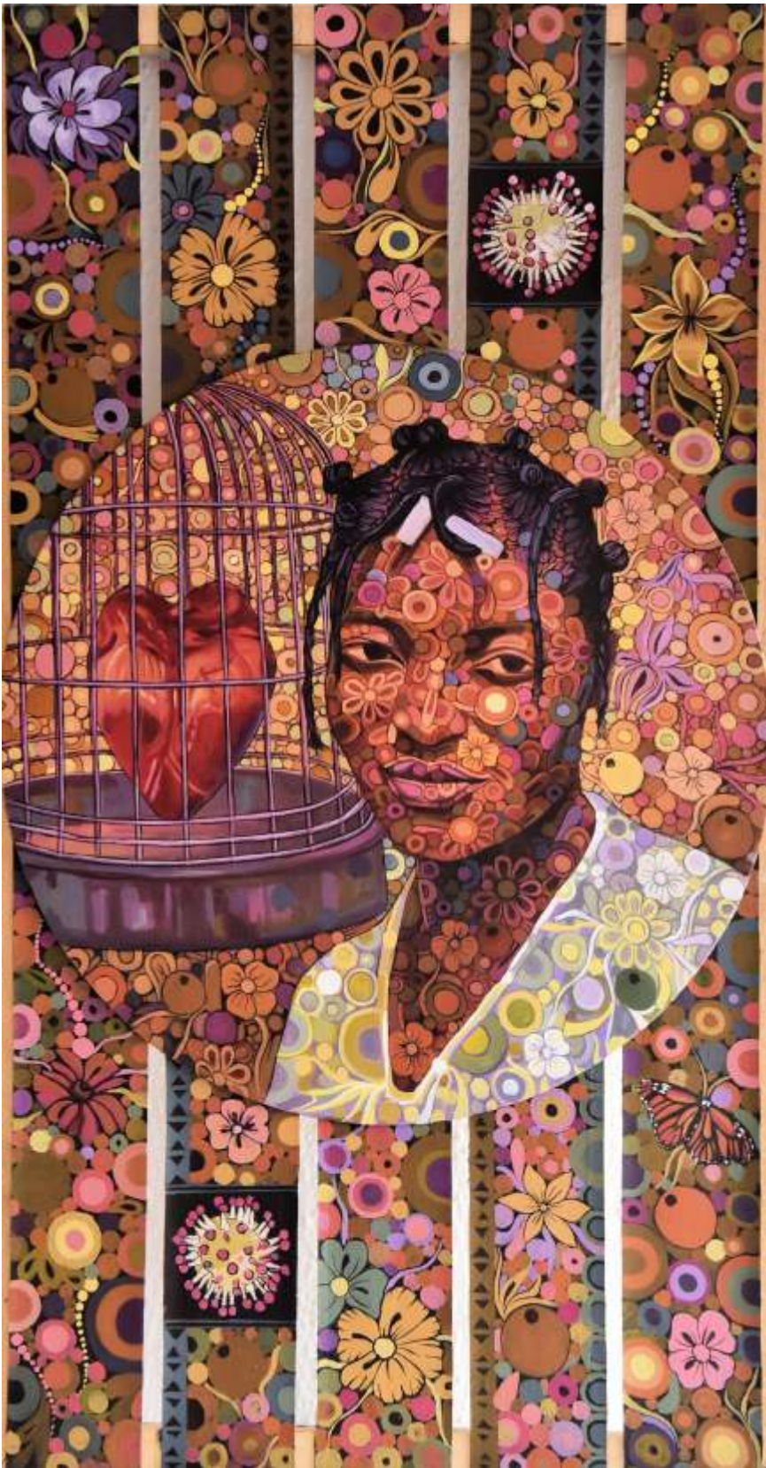
Entanglement , Medium: Acrylic on Window Blinds, Canvas on Circular Board, Dimension: 26x48.5 inches.