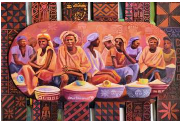
Who Sales First Medium Acrylic on Window Blinds and Circular board Dimension: 18.2x12 inches.