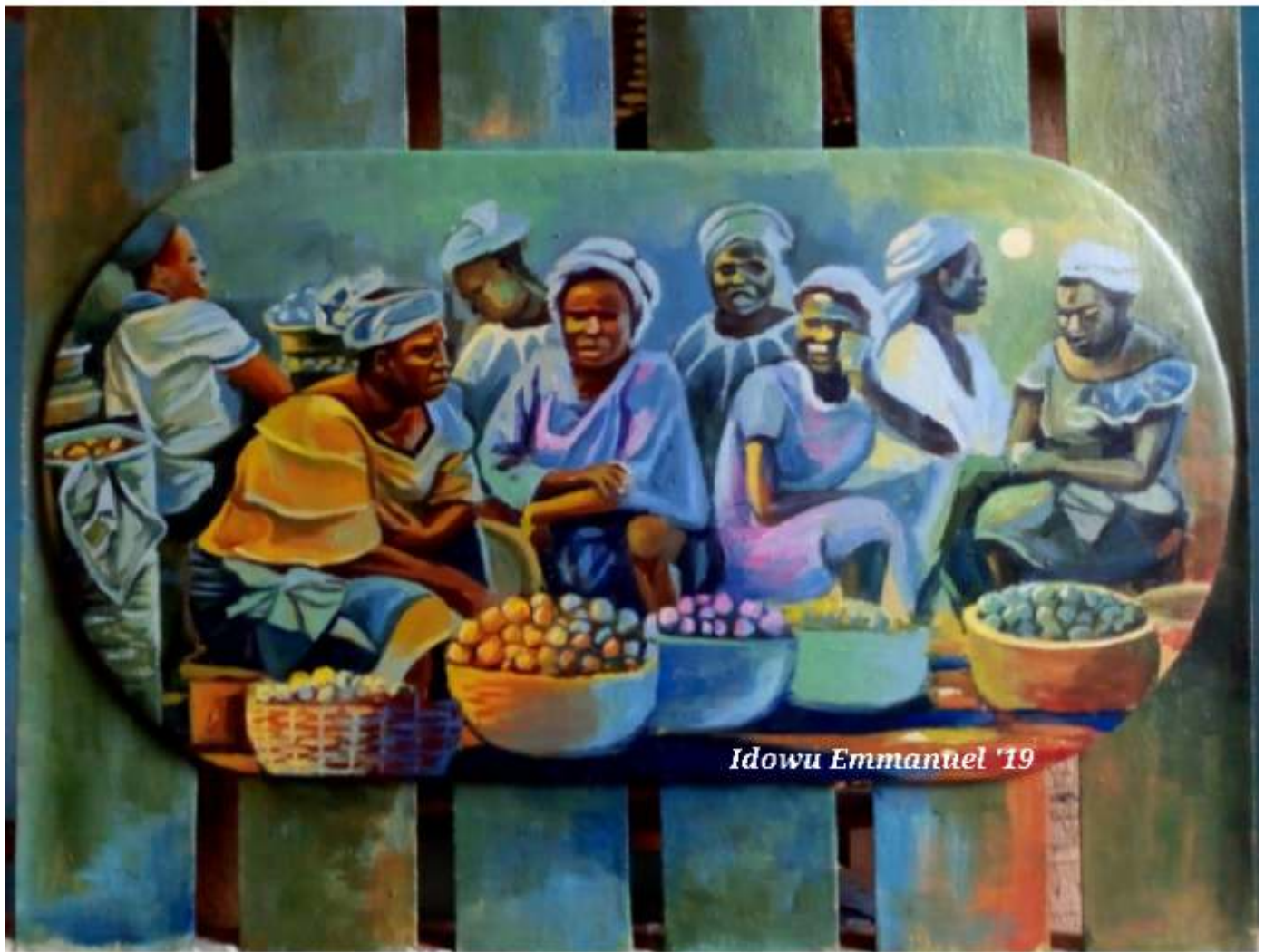
Await the End of Lockdown , Medium: Acrylic on Window Blinds, Canvas on Circular Board Dimension: 17.5x13 inches.