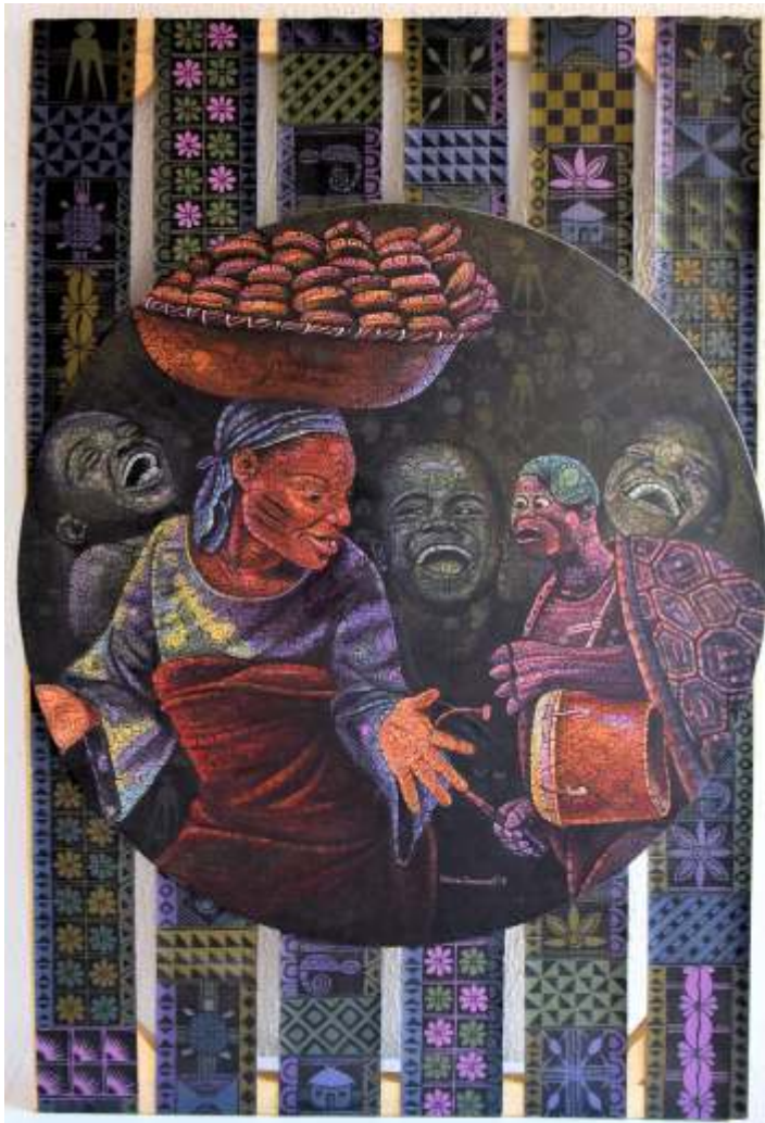
Tortoise and the Fish Seller , Medium: Acrylic on Window Blinds, Canvas on Board. Dimension: 36x53 inches.