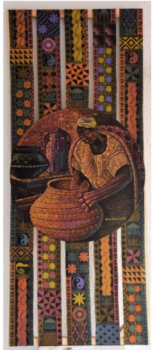
Beds of Roses , Medium: Acrylic on Window Blind, Canvas on Circular Board, Dimension: 20x49 inches.