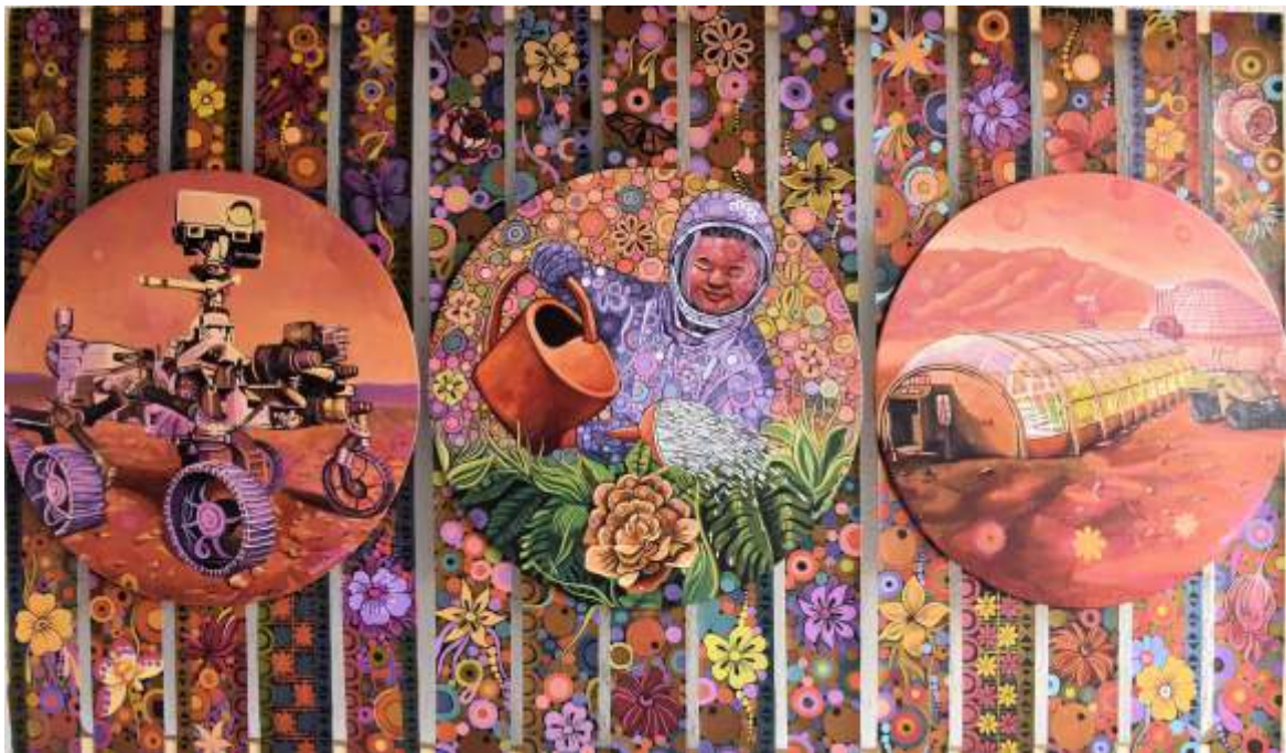
Mars Exploration , Medium: Acrylic on Window Blinds, Canvas on Circular, Boards, Dimension: 60x35.5 inches.