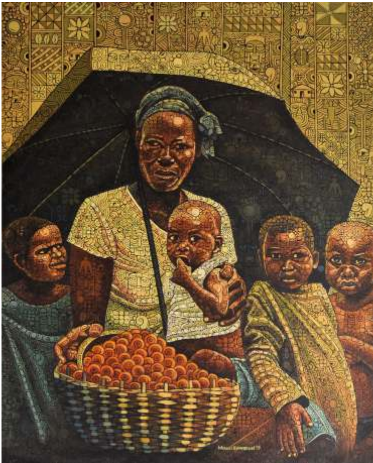
Omobeere , Medium: Acrylic on Canvas, Dimension: 48x39 inches.