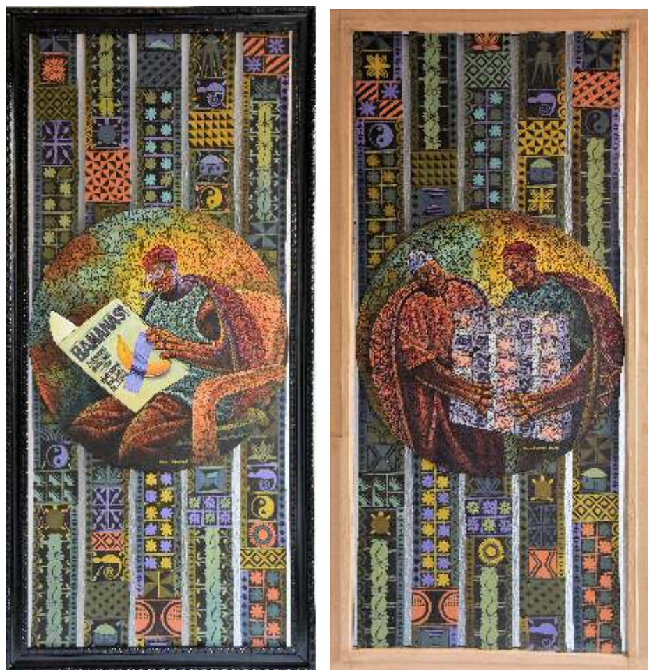
20 Lies Idioms , (Double sided) Medium: Acrylic on Window Blinds, Canvas on Circular Board,