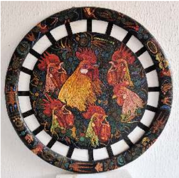
6pm Rose , Medium: Oil on Canvas, Dimension: 28x28 inches