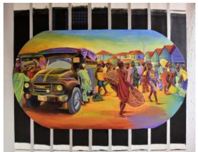
Ageless Wisdom Medium Acrylic on Window Blinds Canvas on Board Dimension: 35.5x47.5 inches.