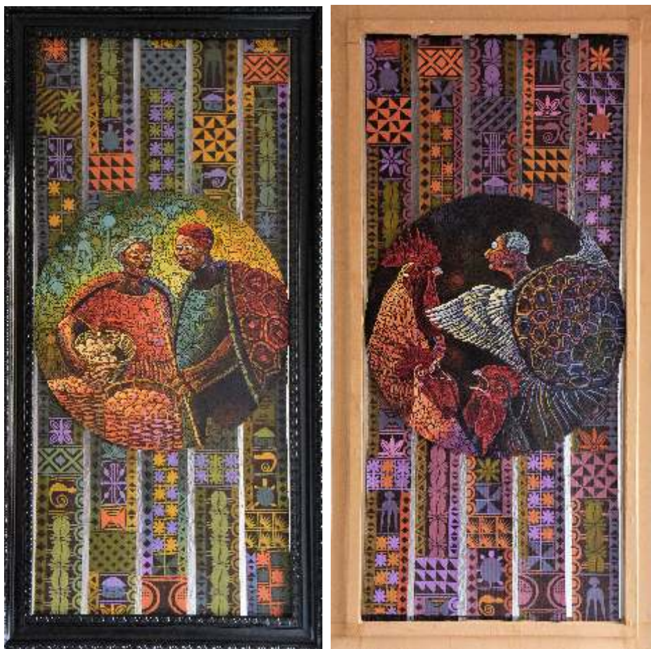
Food Gatherer and the Flying Hungry Tortoise (Double sided), Medium: Acrylic on Window Blinds Canvas on Circular Board, Dimension: 18x41 inches.