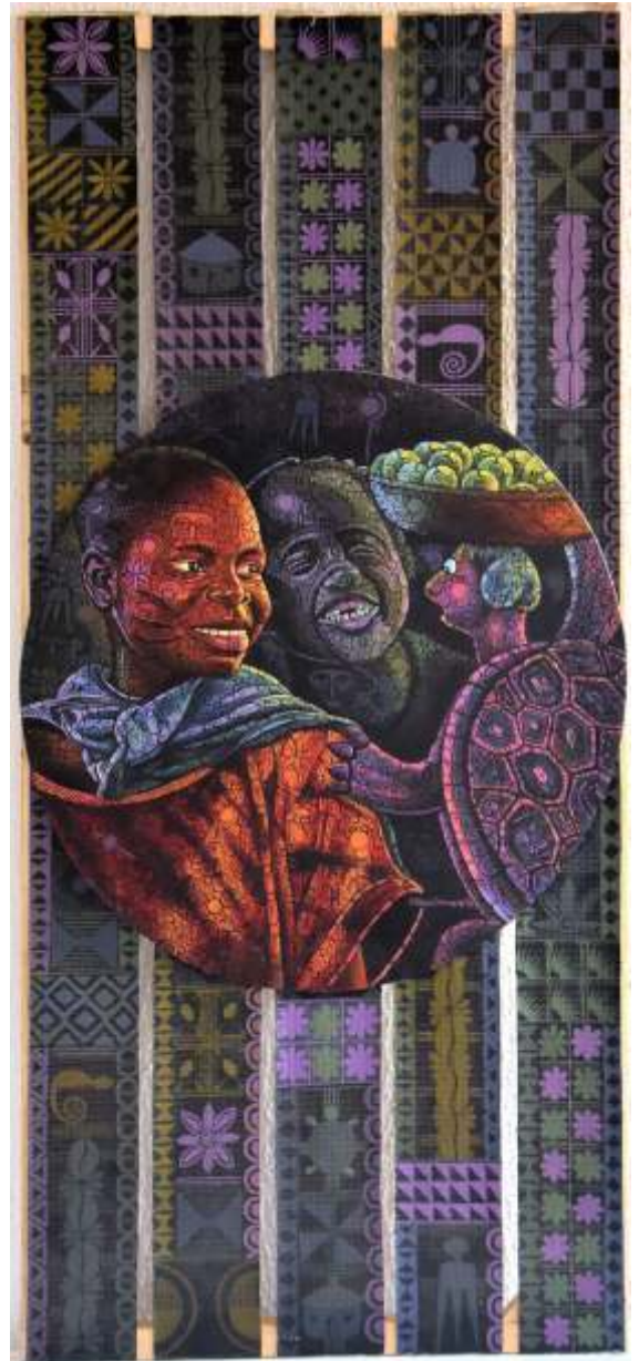
Tales we Love Medium: Acrylic on Window Blinds, Canvas on Circular Board Dimension: 24.5x52.5 inches.