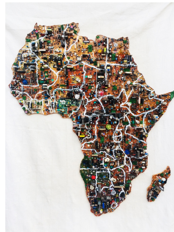
Ezeokwe Arinze Nestor, Art, Upcycling Afric wood, glowing beads electronics boards, synthetic grass & flower 152cm x 182cm. 5x6ft

Living the life of ones dream there are always obstacles and setbacks how one scale through determines what is achieved and when the foundation is bad the growth too becomes bad. The vision to favour the poorest of the poor was not given in a good fate so the growth was stunted, it affected the promised vision and dream for a better nation and situation became even worst. When everyone thought we will be happy, prosperous and experience a robust economy our dreams were shattered. These unfulfilled vision leads all to fear and setbacks.