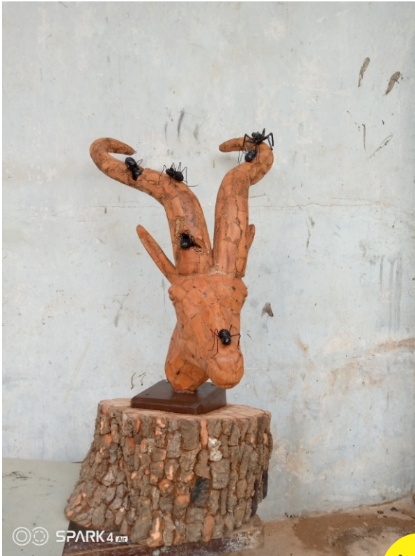
Bassey Uko Archibong. Corrupted Beauty Wood Chip casting 79cm