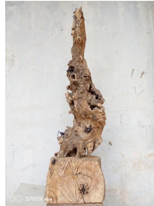
Bassey Uko Archibong Corrupted Vision Driftwood 79cm

In Corrupted Beauty, a beautiful animal figure was used to depict vision 2020 with the destructive human factor as termites. In corrupted vision, vision 2020 takes to provide food and shelter for its people but was destroyed by termites eating its life